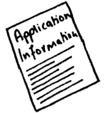
Average Number of New Applications Received Weekly